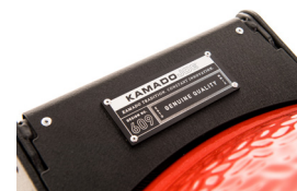
Air Lift Hinge