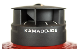
Control Tower Top Vent