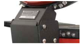
Air Lift Hinge