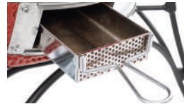
Slide-Out Ash Drawer