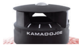
Kontrol Tower Top Vent